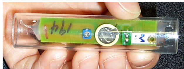
Figure 3: “Featherweight” wireless handheld movement sensors for crowd interaction

This work outlined in this abstract has resulted from the labor of many students in the Media Lab’s Responsive Environments Group – consult the cited references and our website ( http://www.media.mit.edu/resenv ) for more information. We acknowledge the support of the Things That Think Consortium and the other sponsors of the MIT Media Laboratory.