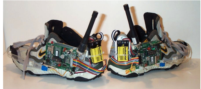
Figure 2: A pair of Expressive Footwear Shoes circa 2000

The hardware has evolved since into a compact, configurable package of layered sensor modules that we term the "Sensor Stack" [4] (Fig. 2). As each layer encapsulates a dedicated sensing modality (e.g., a 6-axis inertial measurement unit,